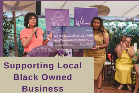
Supporting Local Black Owned Business